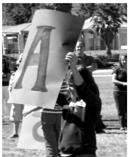
Student Council officers lead students in U.S.A. cheer.

students topped them all with, "Have privacy!" Then everyone in a united voice resounded, "Be free!"