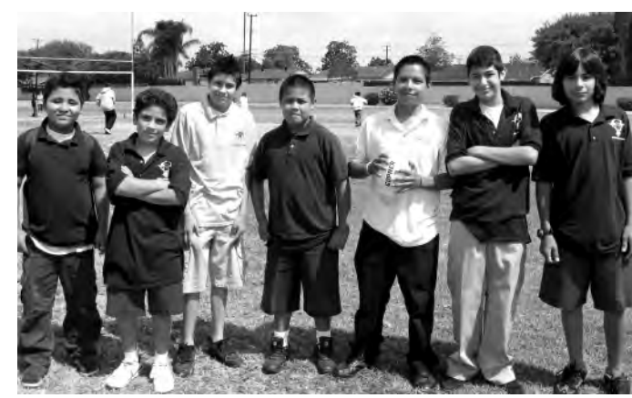
Yorba football teams are ready to go!