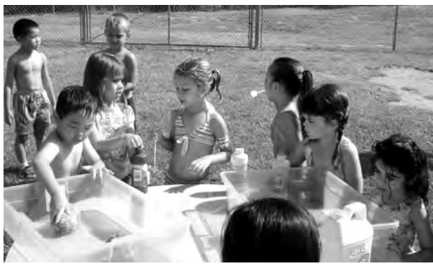
Socialization skills and teamwork are emphasized at Kindergarten's Summer Splash.

We welcome our new Canyon Rim families to the Canyon Rim team, and we look forward to working together as our families grow for years to come.